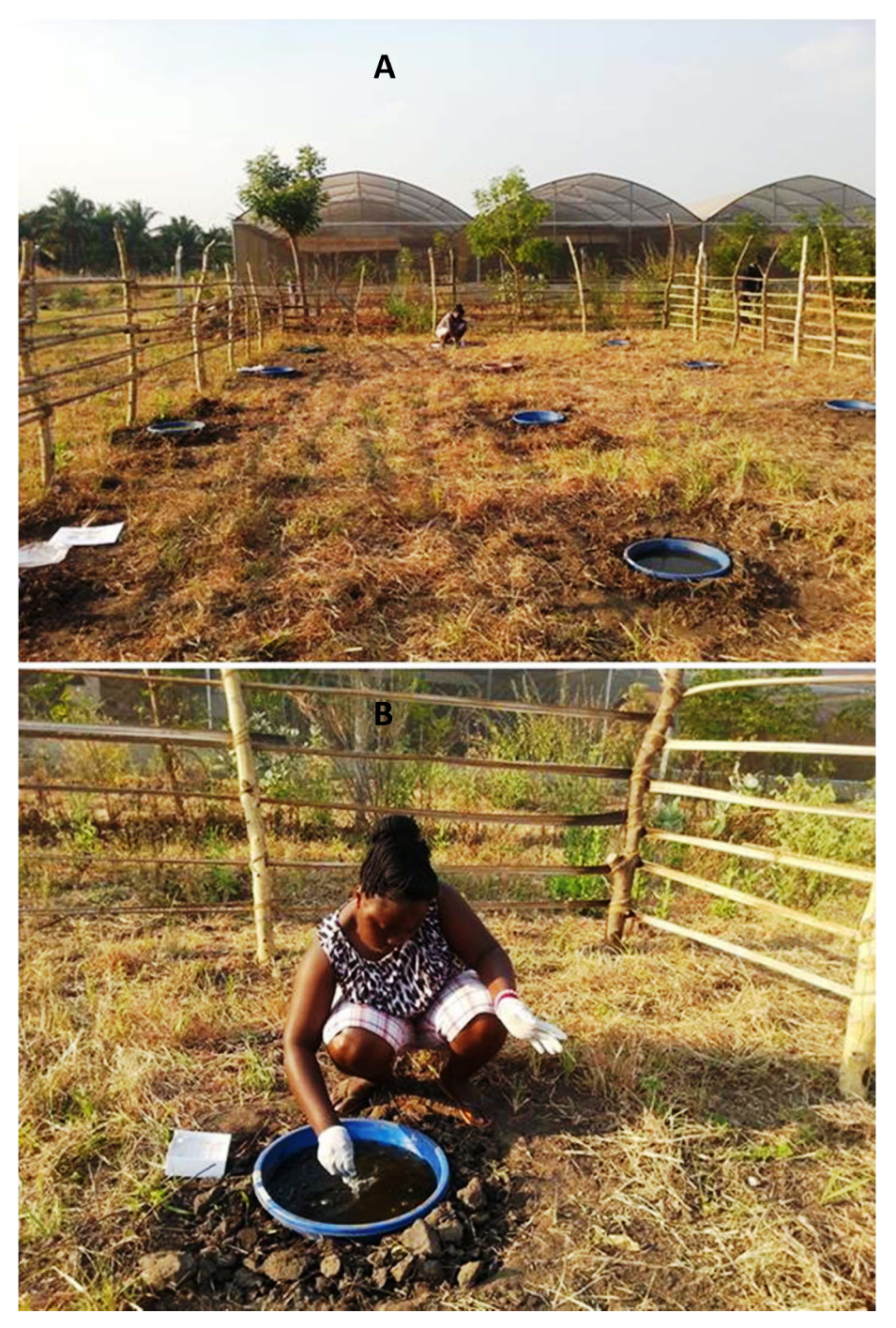
Fig 1. Experimental set up: Showing artificial mosquito breeding habitats created using wash basins (A), and the process of treating breeding habitats with stable isotopes (B).